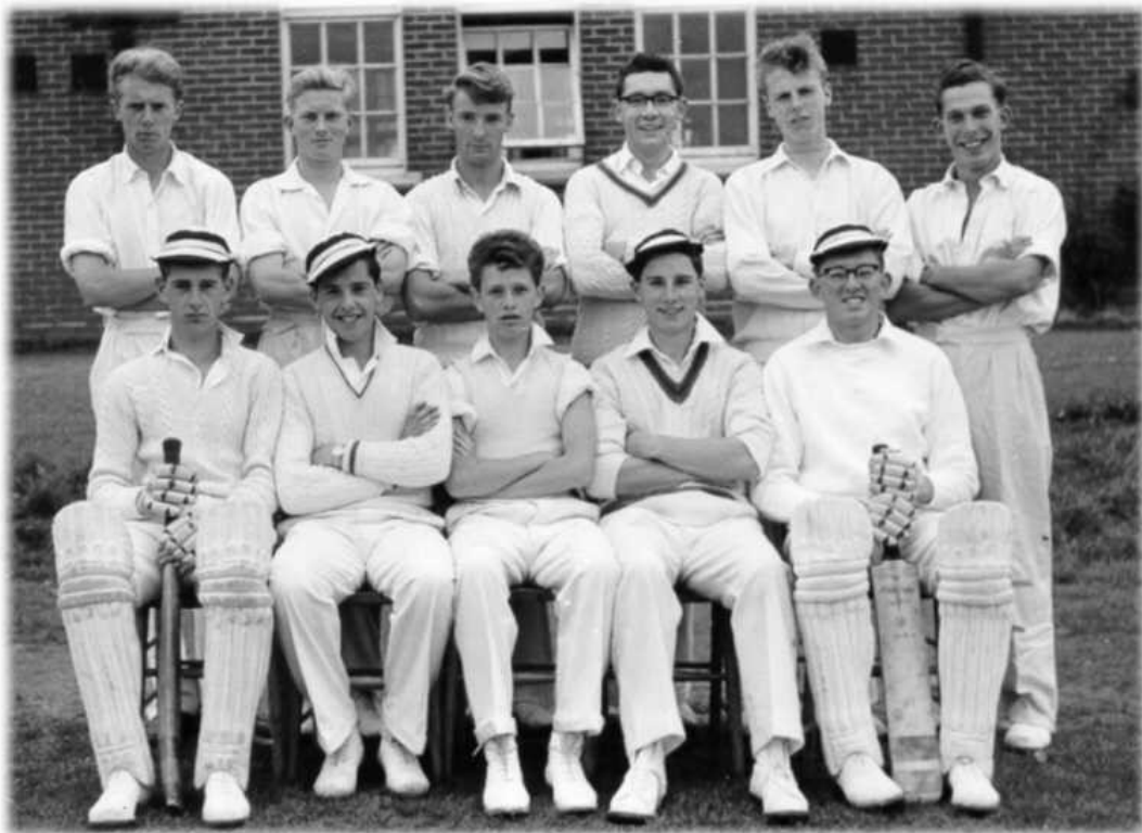
1 st XI Cricket 1957