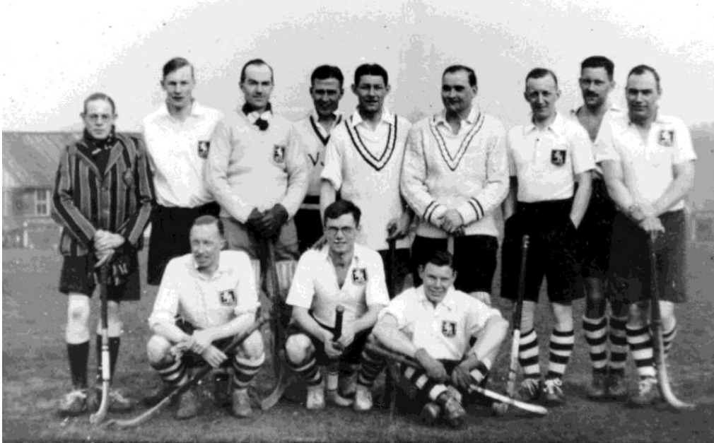
LSOP Sunday Hockey Team 1935-36