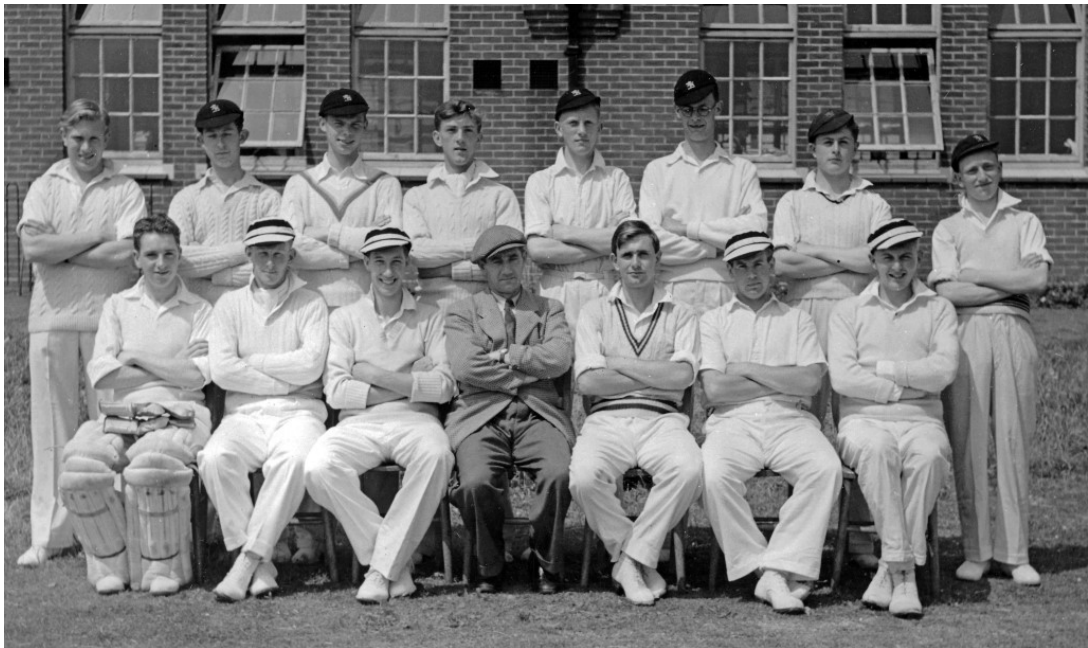
1 st XI Cricket 1951