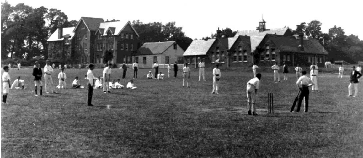
Cricket on the School field circa 1925

An altogether an outstanding decade for cricket. In the four years (1921 to 1924) the team played 42 games and lost a mere three of them.