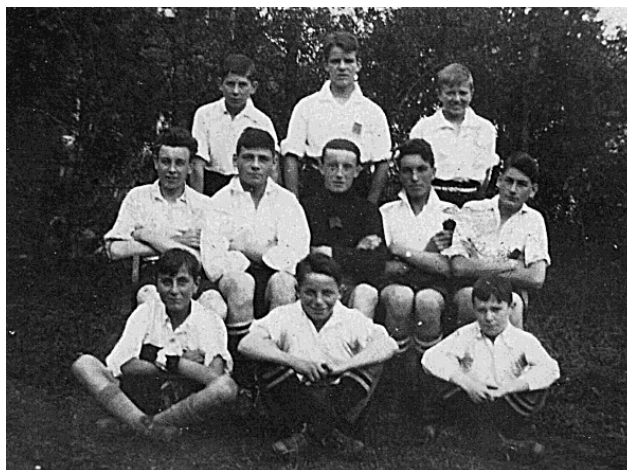
1926 School House Football

There is no photograph of the 1926 1 st XI but there is one of the School House side.